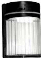
Exterior Wall Fixture