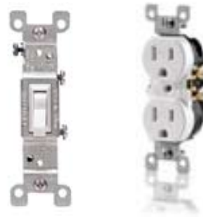
Regular Style Plug and Switch