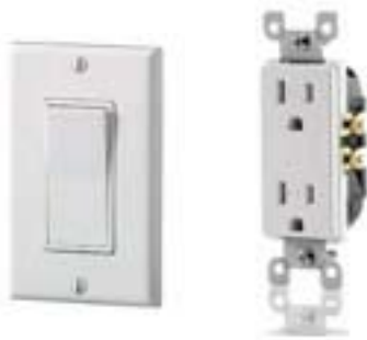
Decora Style Plug and Switch

Circle the type of plug and switch you would like installed.