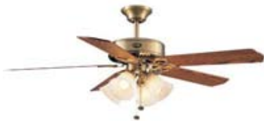
Pendant 52" Ceiling Fan