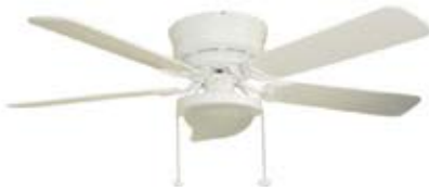
Hugger 52" Ceiling Fan

Circle which fan you would like to have installed.