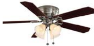
Hugger 52" Ceiling Fan

White (not available without light. No additional charge for the light kit)