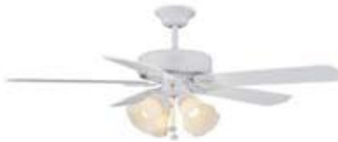
Pendant 52" Ceiling Fan